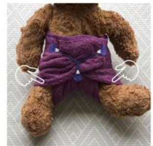
At the moment the legs are loose and can let poo escape