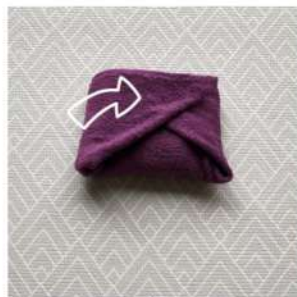
And then the other one