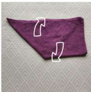
Turn it over. Lifting from the bottom