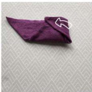
Bring one wing around the baby to the front