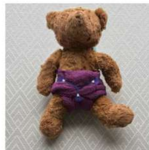
Admire your new folding skills