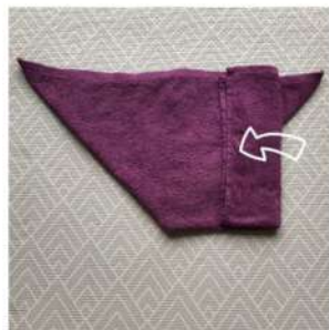
Fold into thirds from the right