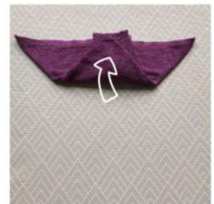
Place the baby on the nappy and pull the bottom of the nappy up.