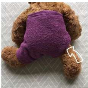
Roll the fabric into the legs, like the edge of a pasty