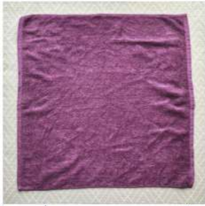
Lay the nappy out in a flat square