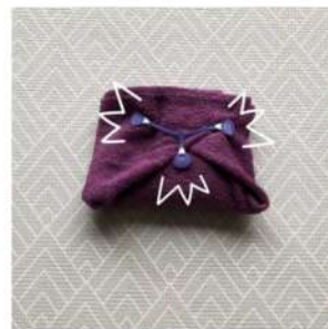
Fasten with a nappy nipper