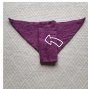
And fold again