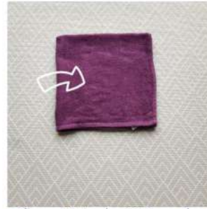
Then fold in half from the left