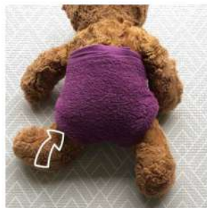
And then the other one, this will give much better containment