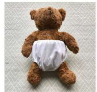
Before adding a waterproof wrap