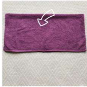
Fold the nappy in half from the top