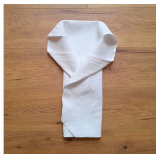
Then do the same to the other side