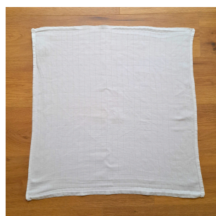
Lay the nappy out in a flat square