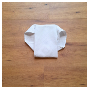
Place the baby on the nappy and pull the bottom of the nappy up