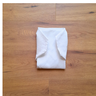
And then the other one