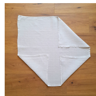
And the next corner