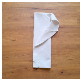
Take the top corner and fan it out to create a wing