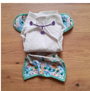
Add a waterproof wrap