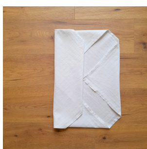
Fold a third of the nappy into the middle