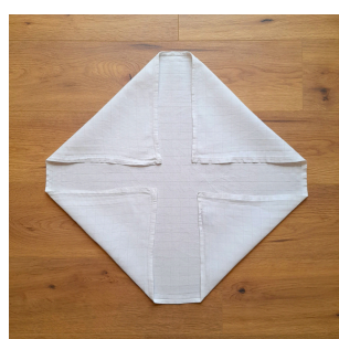
And finally the last corner