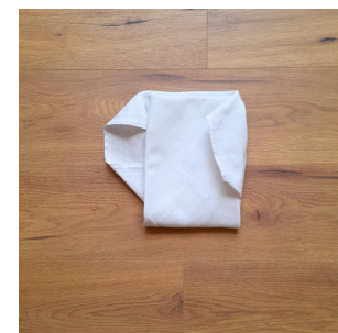
Bring the wing around the baby to the front