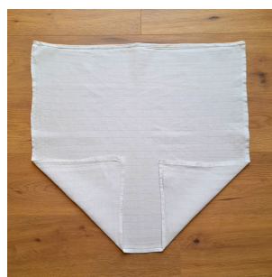
Then the next corner