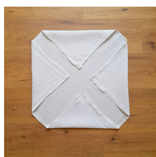
Rotate the whole thing around so the flat edge is at the bottom