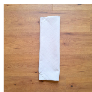
And then the other side into the middle