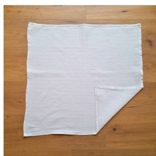
Fold one corner towards but not as far as the middle