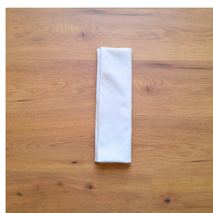
And then the other side into the middle