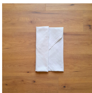
Fold a third of the nappy into the middle