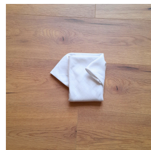
Bring the wing around the baby to the front