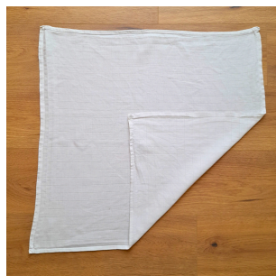
Fold one corner in past the middle. The further in the smaller it will be