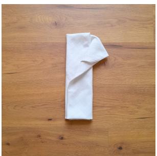
Take the top corner and fan it out to create a wing