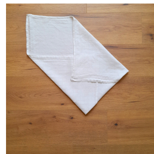
And the next corner