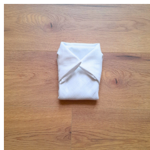
And then the other one