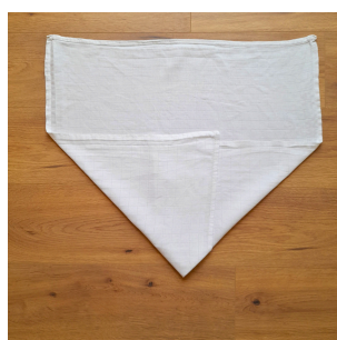
Then the next corner