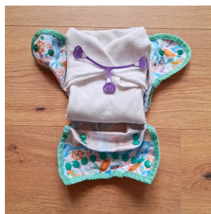
Add a waterproof wrap