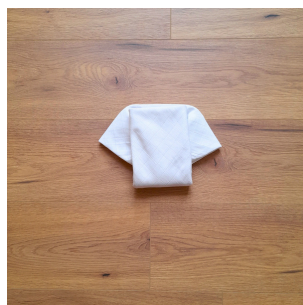
Place the baby on the nappy and pull the bottom of the nappy up