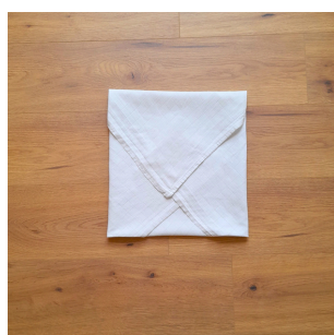
Rotate the whole thing around so the flat edge is at the bottom