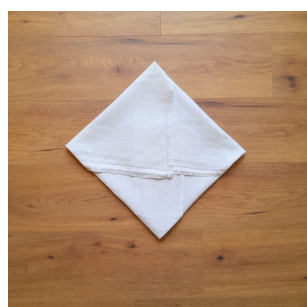
And finally the last corner