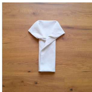
Then do the same to the other side